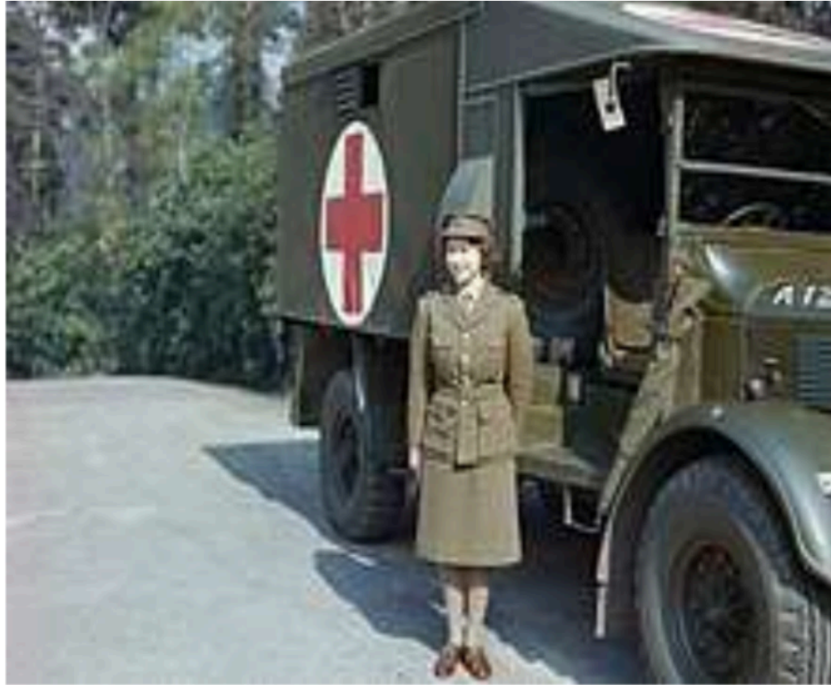
Her Majesty learnt how to drive trucks after signing up during World War II

The British Legion-Bahamas Branch honors its late Patron, Her Majesty, Queen Elizabeth II, as she will be remembered in playing her role in World War II.